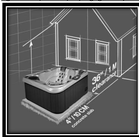
Figure 1 – Espace requis (dégagement) et support